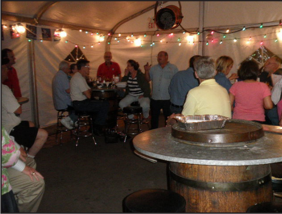
March club meeting at the Armadillo