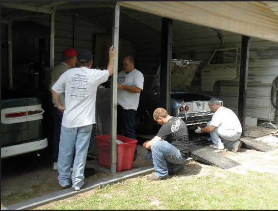
Club Tuna preparing for HOT