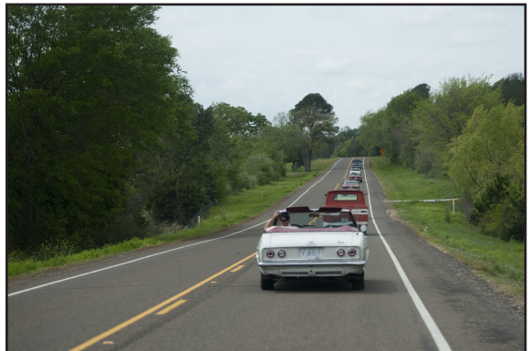
On the road - Carlos Fun Run