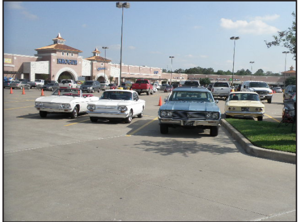
Opening Day at Niftee Fiftees