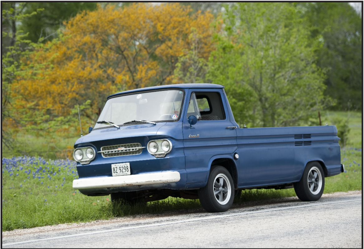
A 1964 Rampside enjoying a lazy Spring day in Texas

This month: No regular club meeting as we will be in Salado, TX celebrating the 16th Annual Heart of Texas Reunion